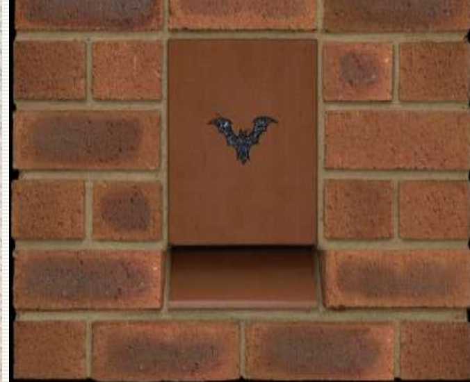
Photo 1: Flat (self cleaning) woodcrete bat box hung on a south-facing aspect of a mature tree. Photo 2: Selection of woodcrete bat boxes. Photo 3: Integrated bat box