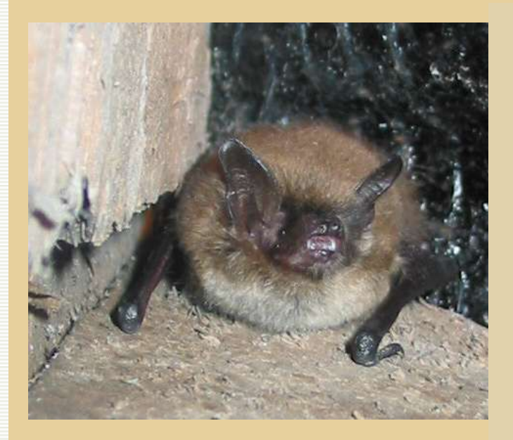
Above: Natterer's bat.

Bats are widely distributed throughout a range of habitats in the Irish landscape. Due to their reliance on insect populations, specialist feeding behaviour and habitat requirements, they are considered to be valuable environmental indicators of the state and condition of the wider countryside.