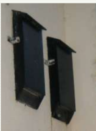
Photographs: 1FF flat woodcrete bat boxes erected on timber poles (this bat box is often used by brown long-eared bats and pipistrelles); Two pipistrelles bats roosting in a 1FF woodcrete box; bat tube strapped to ceiling of culvert (similarly could be used for internals walls); timber maternity boxes erected on exterior wall.

For more information on bats please check out the following websites and guidelines:www.batconservationireland.org – there are series of guidelines on Bats in Buildings, Bat and Lighting etc. that will provide more detailed information. www.batroostireland.org is a website with specific information on bat boxes that have been successfully designed to provide suitable conditions for maternity roosts in Ireland.